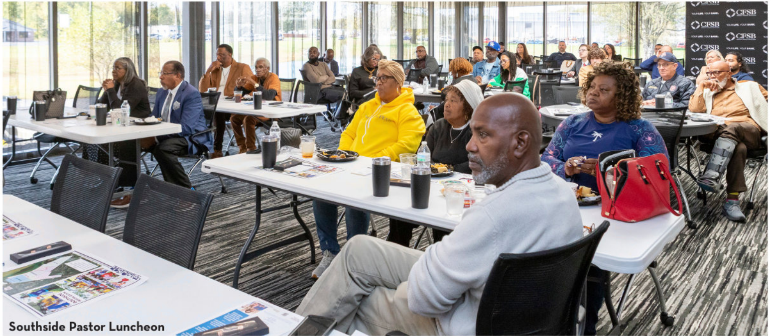
Southside Pastor Luncheon