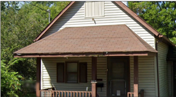
503 Walter Jetton before